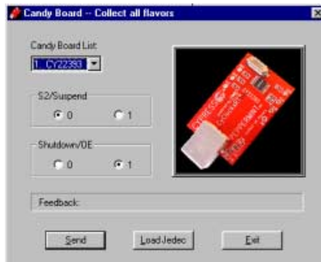
Figure 1. Candy Board Set-up Window

Windows is a trademark of Microsoft Corporation. CYClocksRT™ is a trademark of Cypress Semiconductor Corporation. All product and company names mentioned in this document are the trademarks of their respective holders.