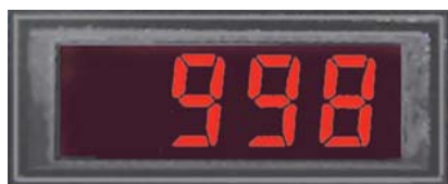
Red Negative Bezel Mount