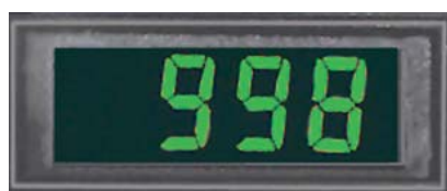
Green Negative Bezel Mount