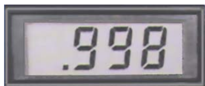
Green Positive Bezel Mount

Large, low-cost 3 1/2 Digit Backlit Bezel Mount LCD Display Digital Panel Meters