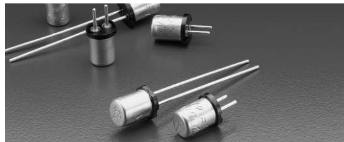
262 000 Series