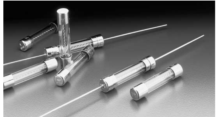
312 000 Series