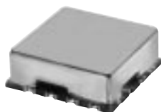
CASE STYLE: DV874