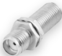
CASE STYLE: DJ952