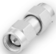
CASE STYLE: DJ951