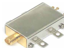
CASE STYLE: GB956