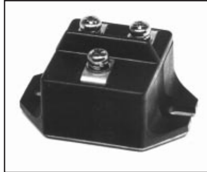
CD240602, CD241202 Fast Recovery Dual Diode Modules 20 Amperes/600-1200 Volts