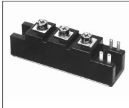
CM4312A2, CM4316A2 Dual SCR POW-R-BLOK™ Modules 25 Amperes/1200-1600 Volts