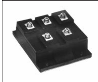
ME601215, ME601615 Three-Phase Diode Bridge Modules 150 Amperes/1200-1600 Volts