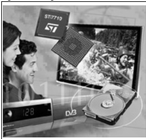
Figure 2. High definition satellite or terrestrial set-top box