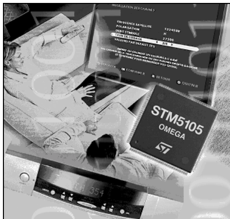
Figure 1. STM5105 low-cost interactive set-top box

STM5105 is supplied in either 24 mm x 24 mm LQFP216 or 23 mm x 23 mm BGA package.