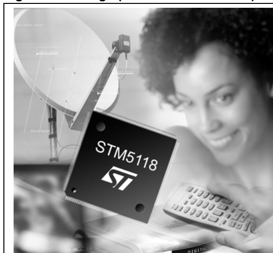
Figure 1. Package (24 x 24 mm LQFP216)