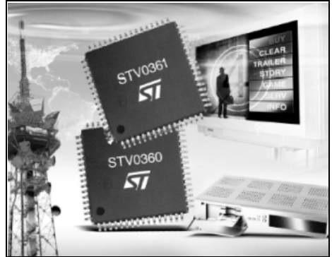
Figure 1. Package/ 64-pin TQFP