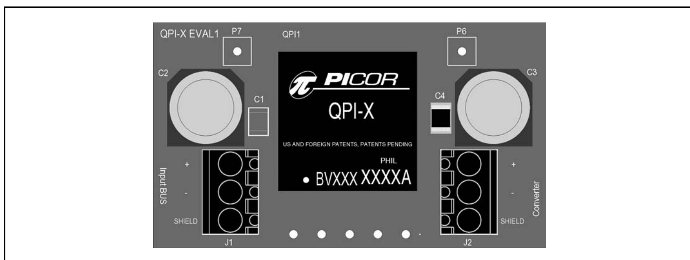
Figure 3 - QPI-X EVAL board showing location of components and connectors.