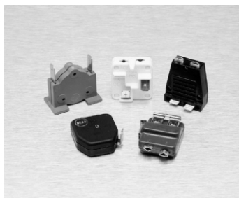
Motor Start Relays